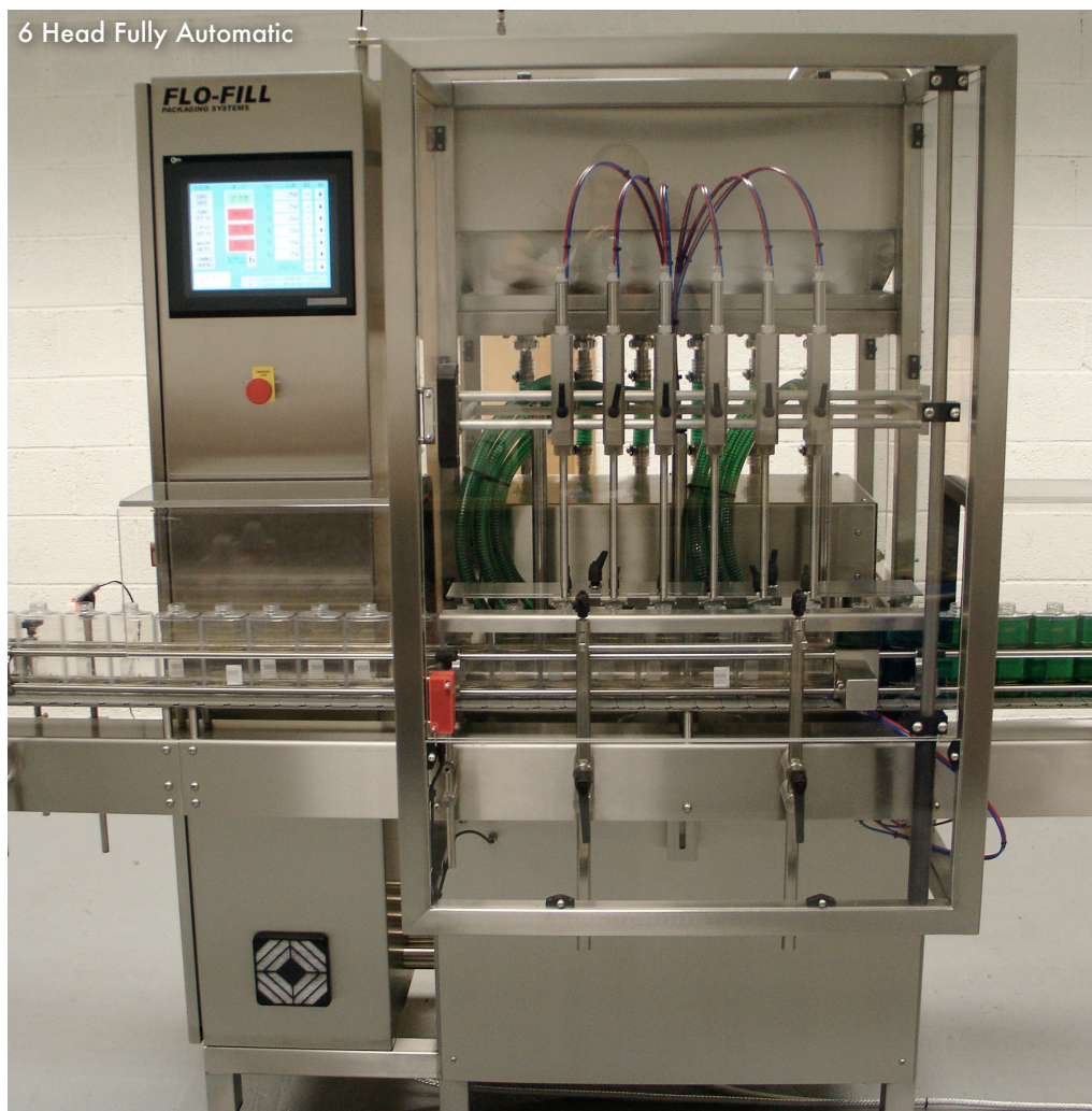
6 Head Fully Automatic

Tel: 0113 2715522 Fax: 0113 2715544 Email: sales@flo-fill.co.uk Web: www.flo-fill.co.uk